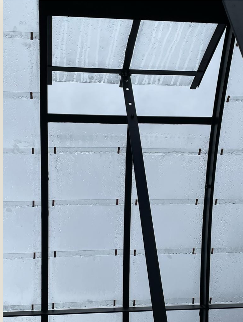
Greenhouse during winter.